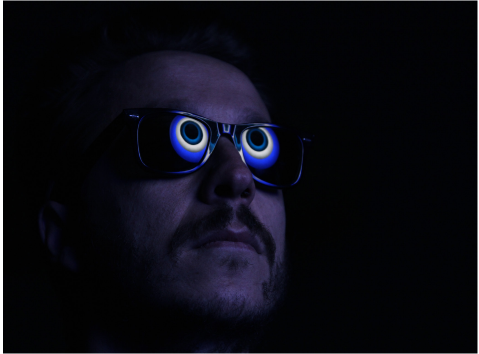
Driton Selmani — Eye To Eye , 2017 Steel tubes, LED lights, fiberglass plates, custom halo system, Dimensions: 11 meters high, 3.5 meters wide Installation view: Amsterdam Light Festival