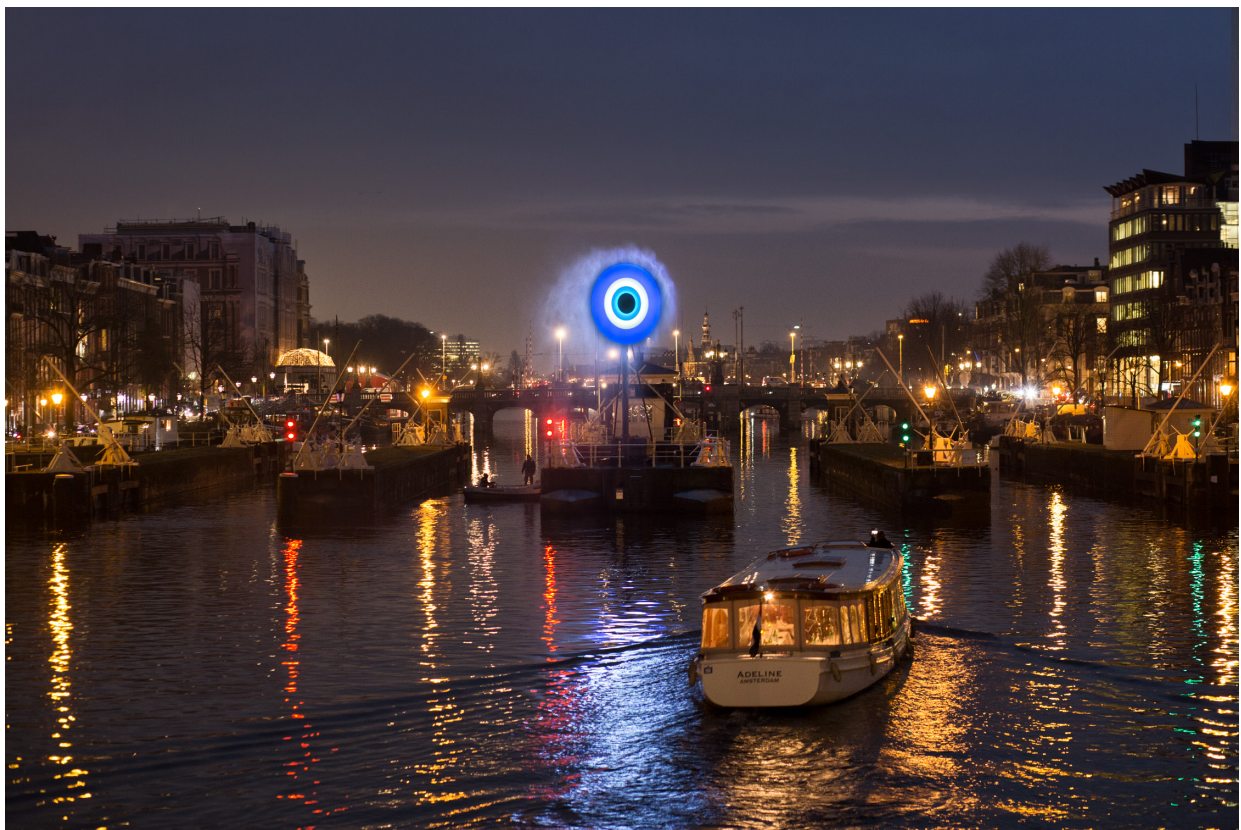
Driton Selmani — Eye To Eye , 2017 Steel tubes, LED lights, fiberglass plates, custom halo system, Dimensions: 11 meters high, 3.5 meters wide Installation view: Amsterdam Light Festival