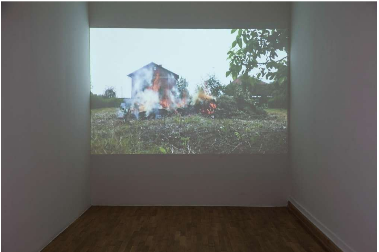
Gazmend Ejupi — Momentary Lapse of Reason 2 , 2017 Single channel video 30 sec. Loop