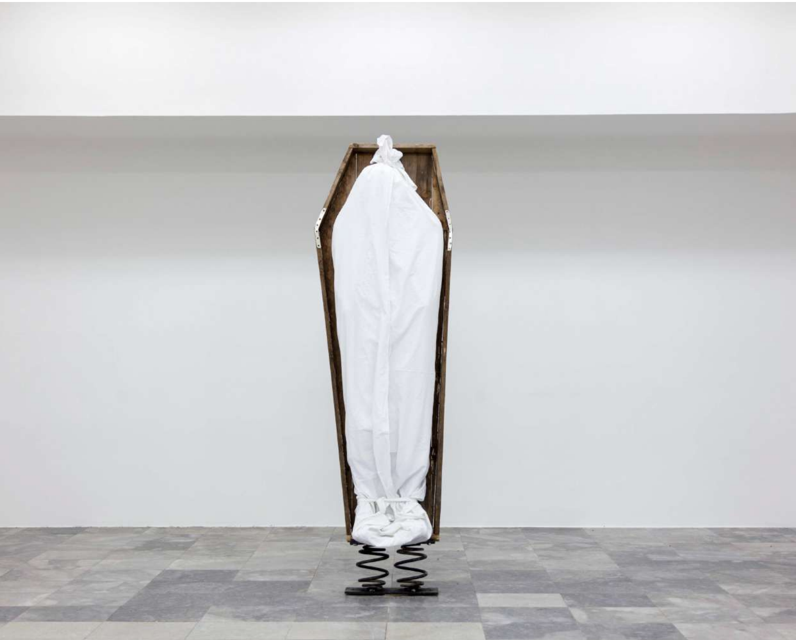
Fatmir Mustafa — Karlo - Last Witness , 2018 wood coffin, coil springs, textile Dimensions: 250 x 100 x 40 cm