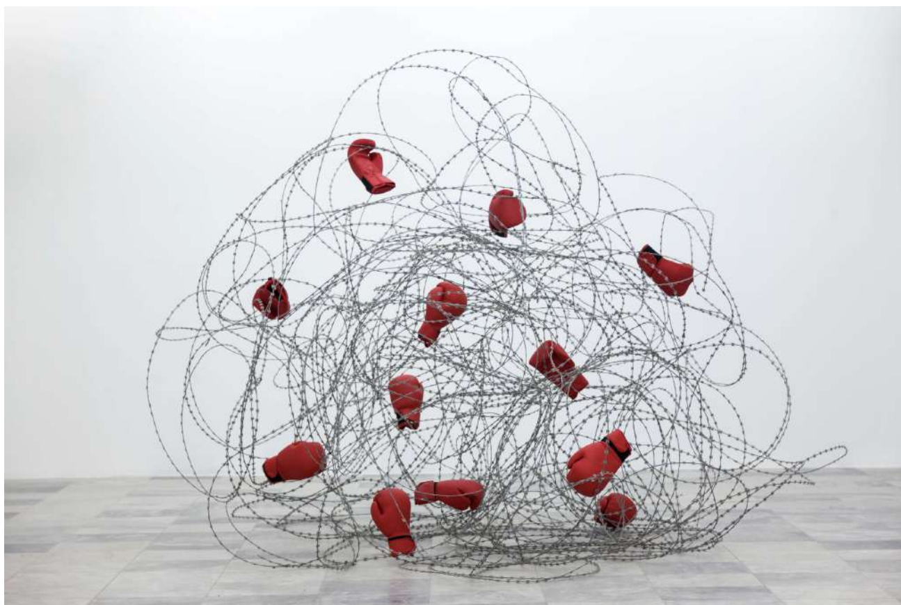
Driton Selmani — The Raw and the Cooked , 2018 Boxing gloves, barbed wire, 300 x 250 x 200 cm