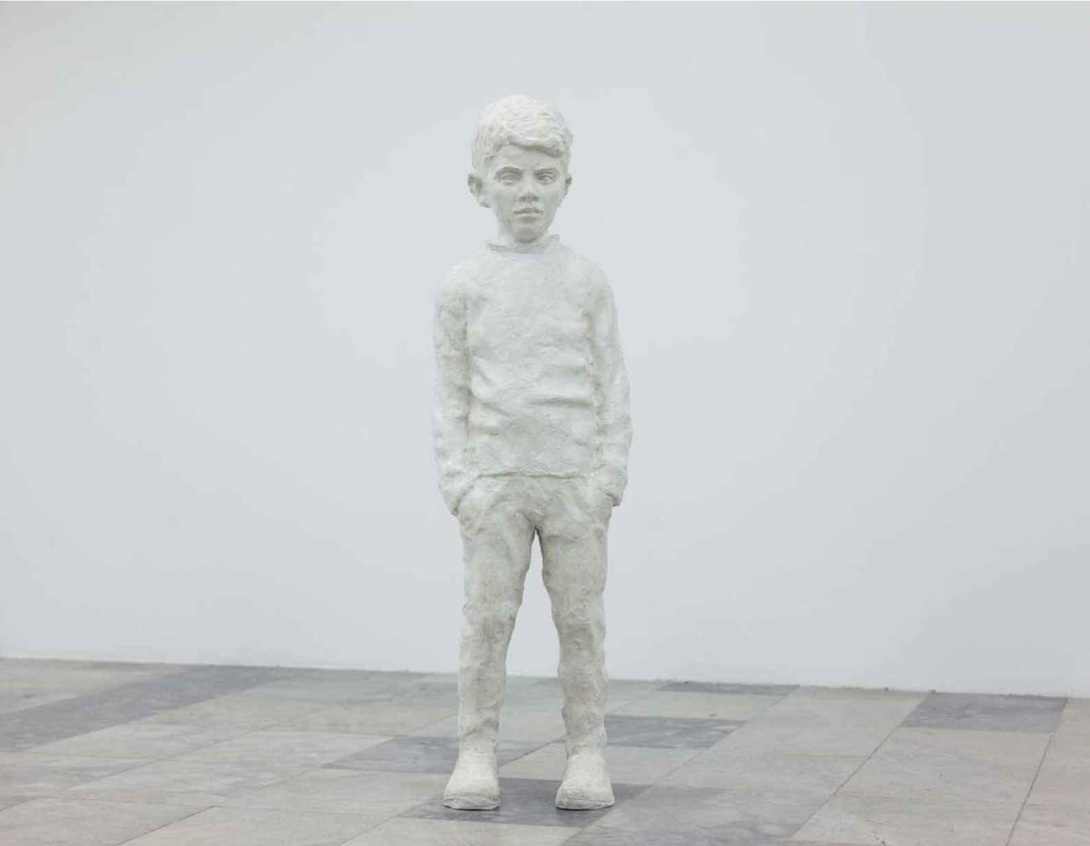
Luan Bajraktari — Vëllau i Milotit , 2017 Gypsum cast sculpture , 100 x 30 x 20 cm