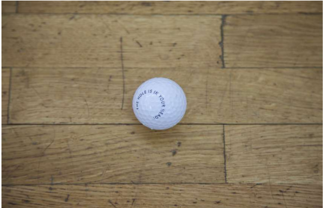
Albert Allgaier — The Hole is in Your Head , 2016 C - print on Aluminum, golf ball Dimensions variable