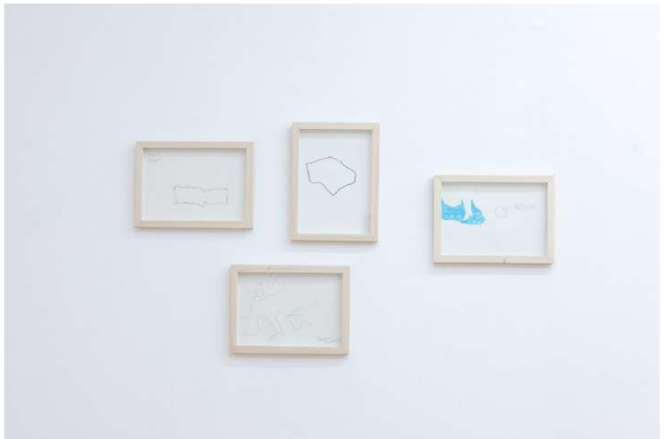
Driton Selmani — Tell me where I am from? , 2012 Variable mixed media drawings on paper