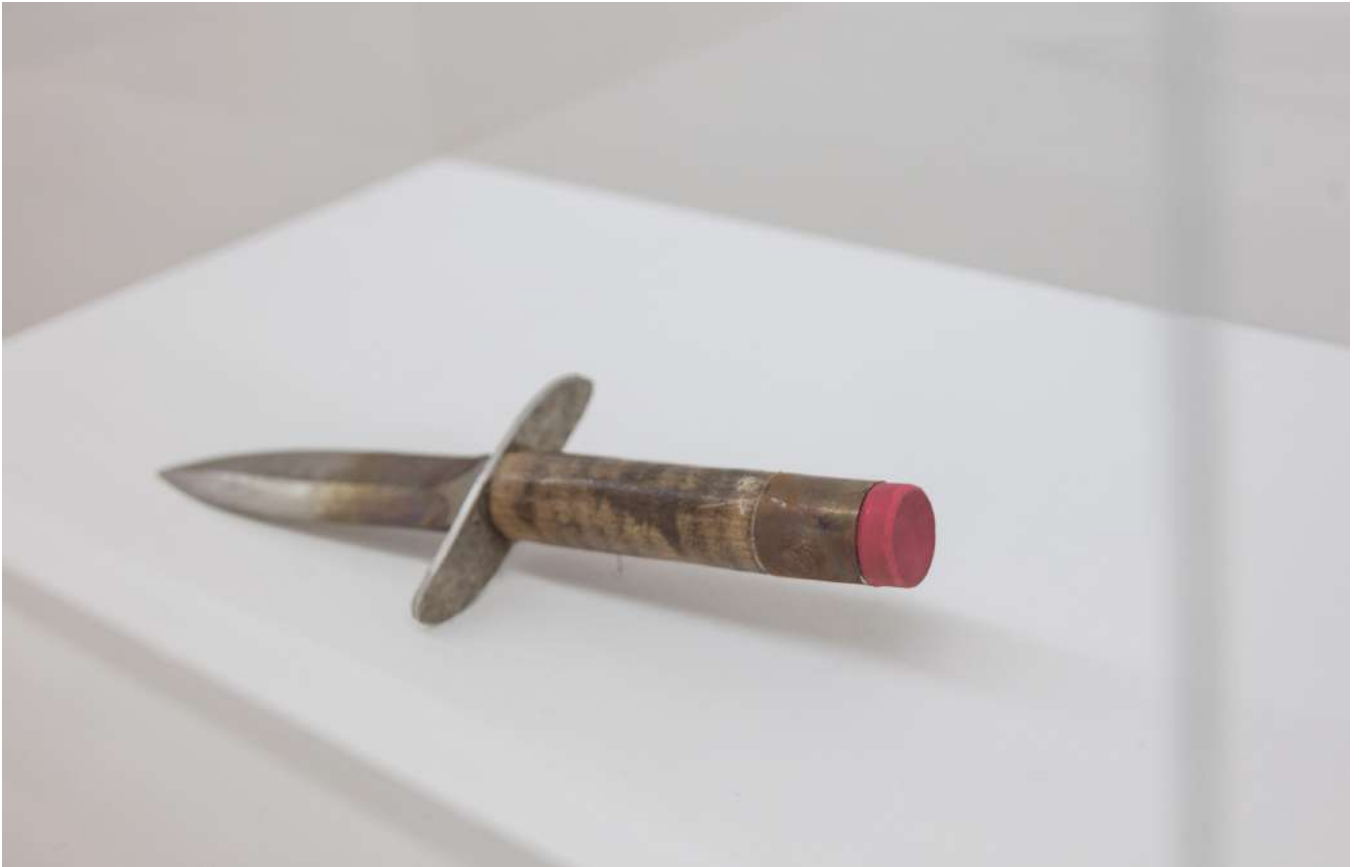
Driton Selmani — Untitled , 2018 handmade knife, eraser 21 x 5 x 6 cm