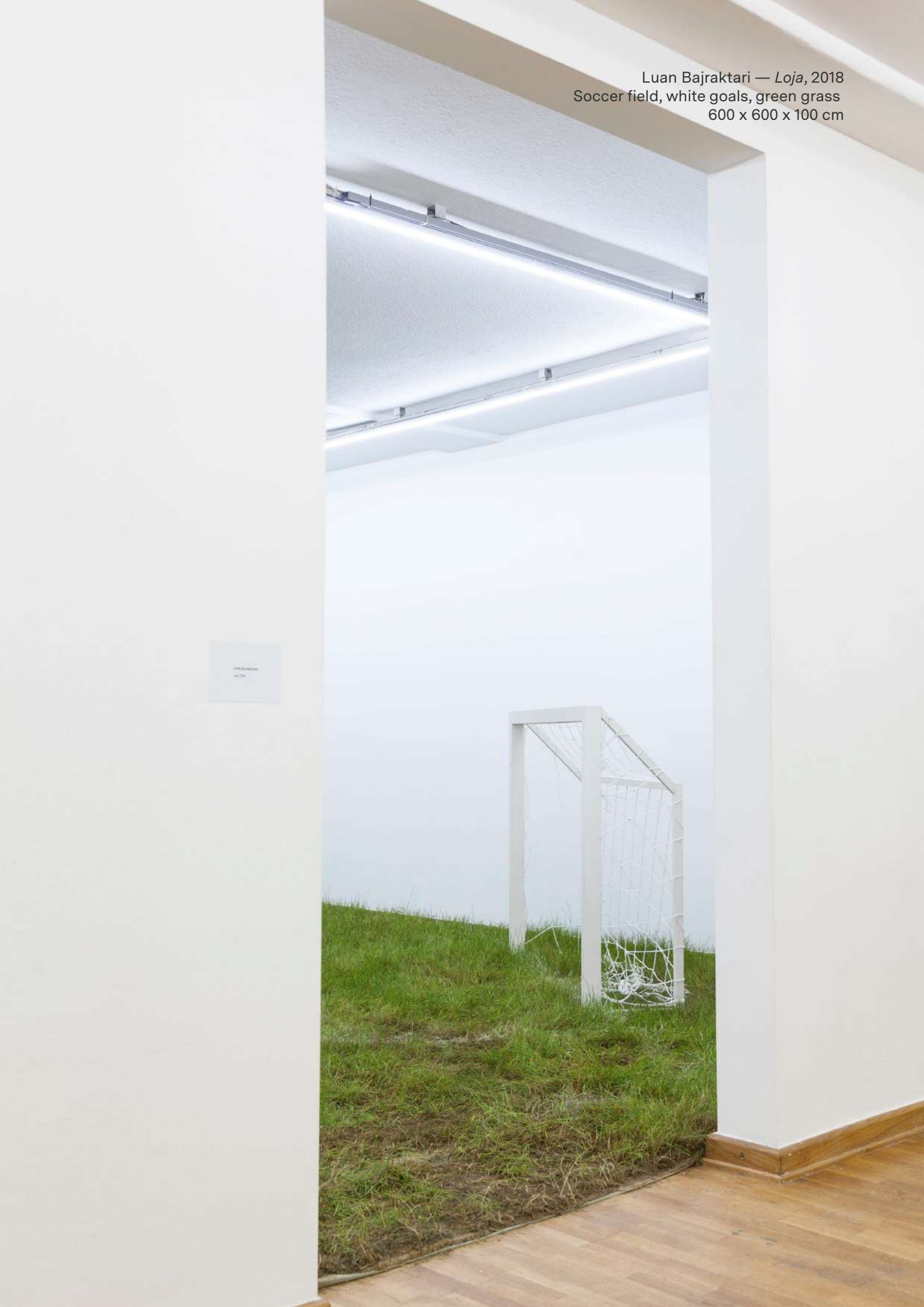
Luan Bajraktari — Loja , 2018 Soccer field, white goals, green grass 600 x 600 x 100 cm