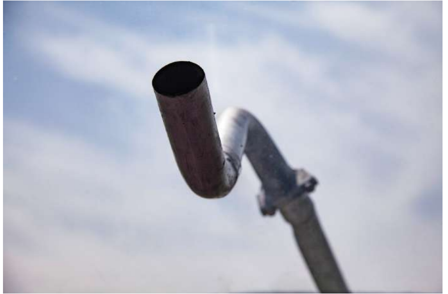
Fatmir Mustafa - Karlo - The View , 2018 VW Golf, custom made exhaust, CO 2 Dimensions: 300 x 200 x 150 cm