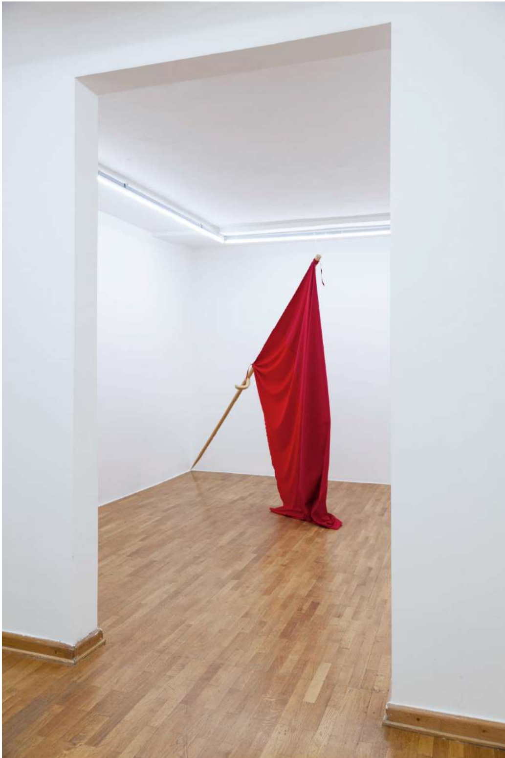
Driton Selmani — Untitled Union , 2012 Collage textile cut from flags, handcrafted scythe tale Dimensions: 400 x 250 cm