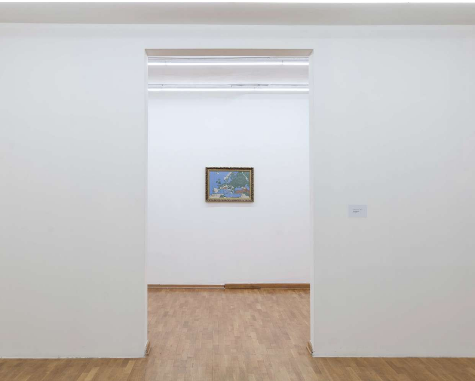
Driton Selmani — Tell me where I am from? , 2012 Embroidery on textile. Dimensions: 90×60 cm framed map