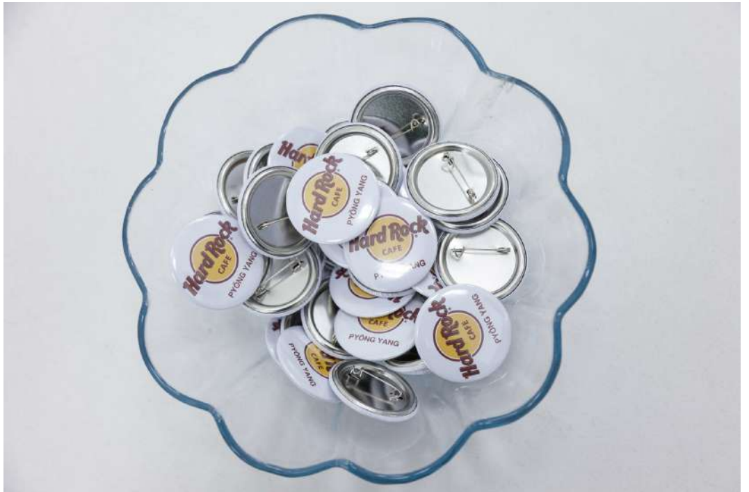
Albert Allgaier — Hard Rock Cafe Pyöng Yang , 2018 Souvenir shop, mugs, buttons, t-shirts, wall clocks Dimensions variable