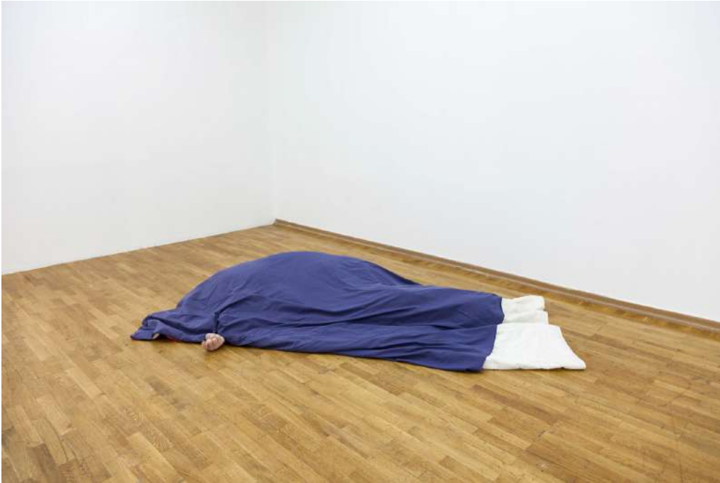
Fatmir Mustafa — Karlo - Hard Working , 2017 Human snot, blanket, gypsum Dimensions: 250 x 150 x 40 cm