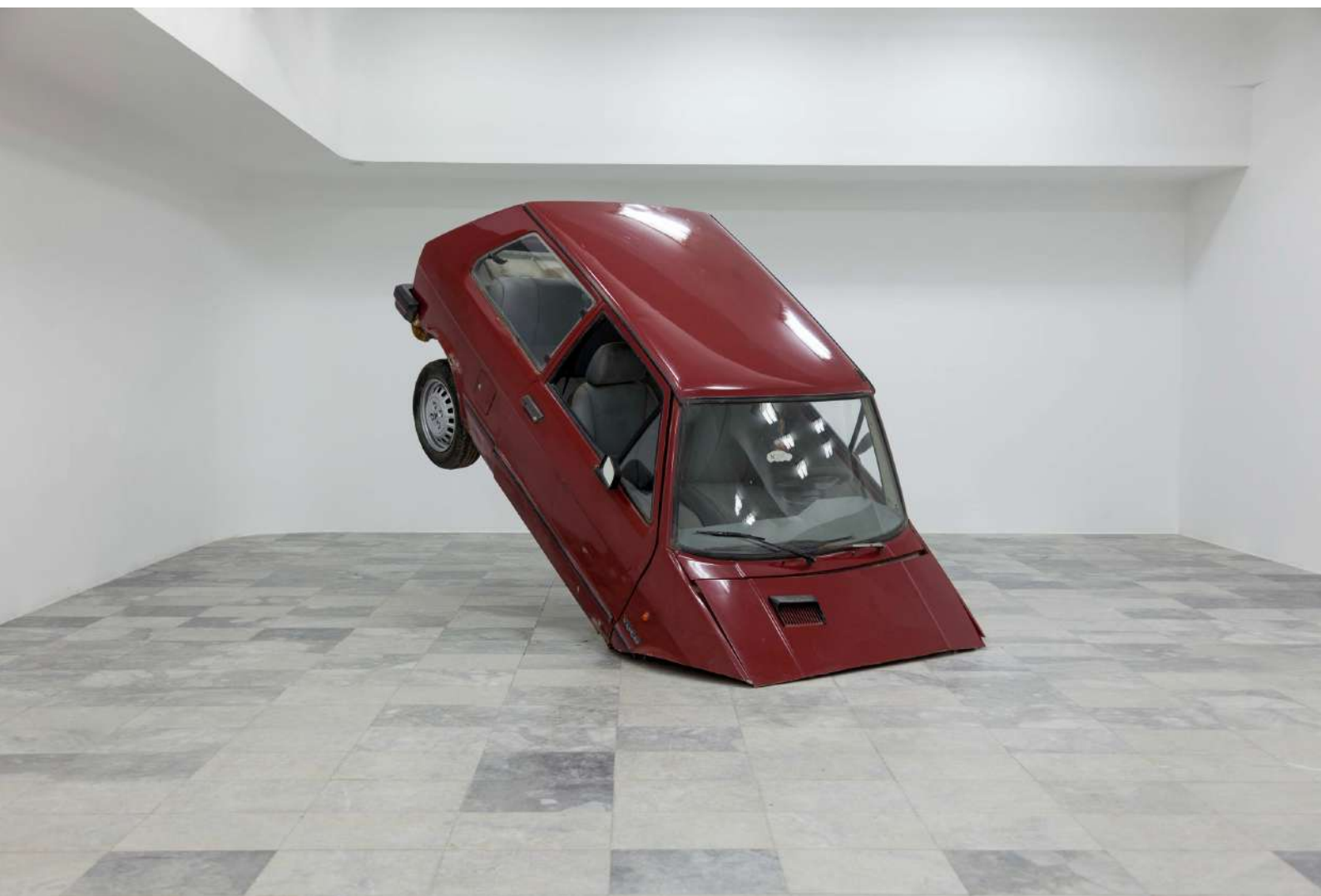
Gazmend Ejupi - YOU-GO , 2018 Family car, sound Instalation Dimensions: 350 x 200 x 300 cm