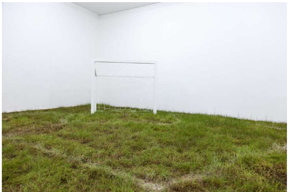
Luan Bajraktari — Loja , 2018 Soccer field, white goals, green grass 600 x 600 x 100 cm